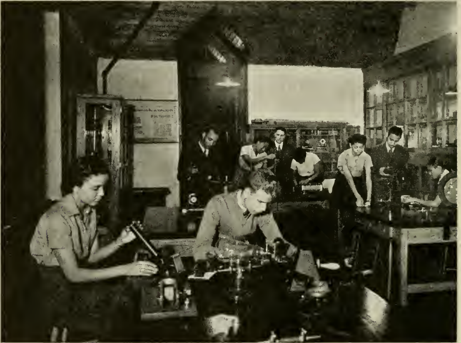
Paine College, Augusta, Georgia, co-operates in the training of cadet nurses

Replying to our editor, however, we thought further of the definite actions which have been taken by the leaders in our schools in community efforts. For example, through the influence of the president of Paine College, "an event worthy of note during the past year was the co-operative plan entered into by Paine College with the Lamar School of Nursing of the University Hospital in Augusta, Georgia. Through this arrangement, dormitory facilities and instructional work were extended to two groups of young Negro women enrolled as cadet nurses at the University Hospital. Forty-two young women enrolled under this program last year. The co-operative plan has been continued for the school year 1944-45, and a larger number of young women possibly will take advantage of the program this year."